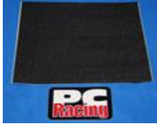
PC10X for DIY